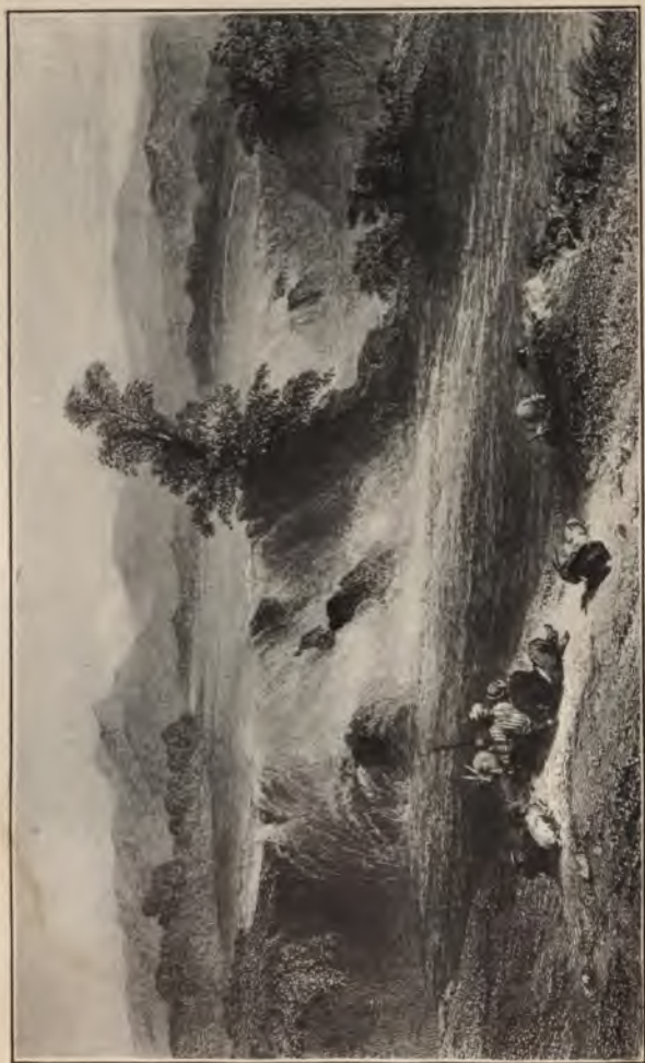
FALLS OF THE CYDNU